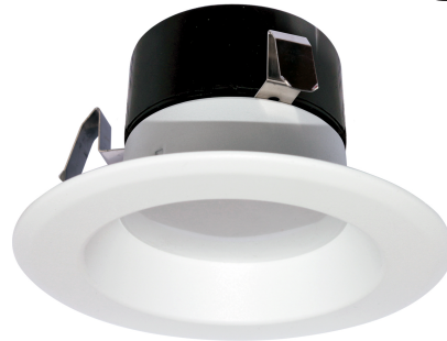
120V Triac Dimming Ver.